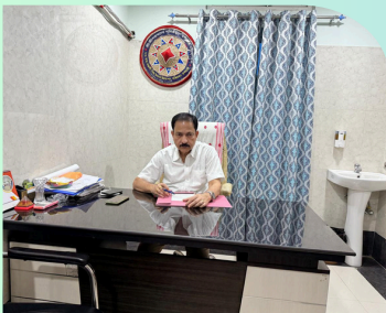
অৱসৰী বিষয়া ইণ্ডিয়ান বেংক অসম সাহিত্য সভাৰ নগাওঁ জিলা কবি উপসমিতিৰ আহ্বায়ক

Skills smooth the path of life After completing schooling, every student arrives at a time when they have to secure their future lives This is a very important time During this time, one has to take the advice of parents, relatives and well-wishers to achieve one's goals If students move forward to make themselves skilled in a particular field/direction, very good results are obtained today. If you can become skilled or proficient in any one subject, especially in the field of health and medicine, then there is no need to worry about the future This is because the field of health and medicine is very wide There are many aspects to this If you can master any of these areas, you will have a special importance and the path to earning will be easier. I am particularly appreciative of the special initiative taken by the Crescent Institute of Paramedical Studies in this regard I hope Crescent Institute of Paramedical Studies will play a special role in smoothing the path of future life for the rising generation I am delighted to be a part of this journey of Crescent Institute of Paramedical Studies and through this article I wish them all the best on their journey.